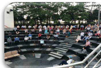
Open Air Theatre