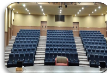
220 Seats Theatre